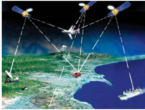
Figure 1 Information traffic