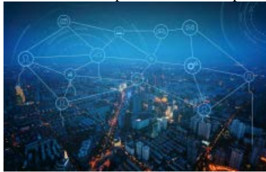
Figure 2 Smart City

to the people's travel. Big data can give full play to the advantages of information integration and realize the scientific allocation and reasonable prediction of transportation resources [2].